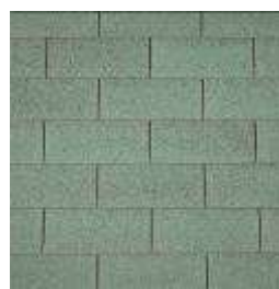
03 - Green