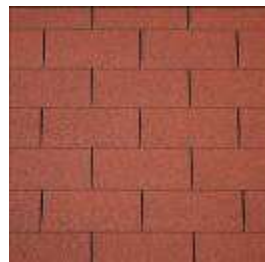
10 - Red