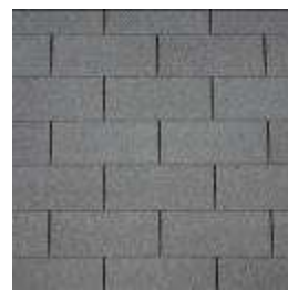
31 - Slate