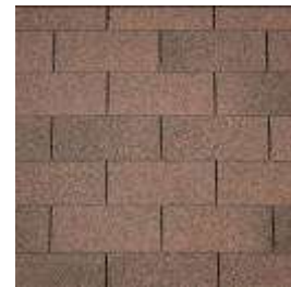
07 - Brown